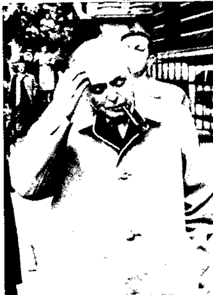
WILSON "nee hundha" Mashed potato