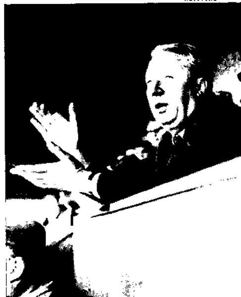
HEATH Full cry.

Of course, a landslide victory had also been forecast for Harold Wilson's Laborites 17 months ago. Instead, they barely broke 13 years of Tory rule, taking office with only a five-seat ma-