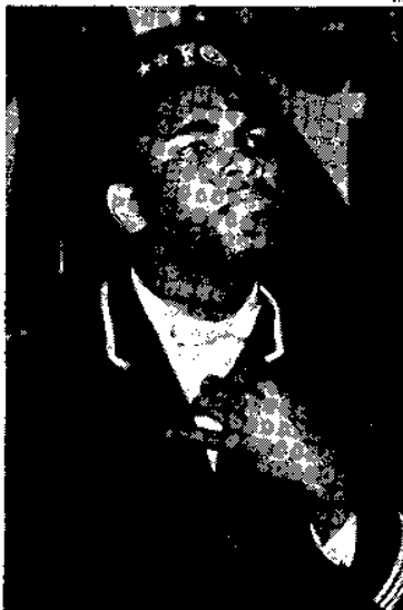
CASSIUS CLAY No battle at Verdun.

Even though he looks militant enough in the dress blues of the Fruit of Islam, the Black Muslims' Special Forces, Boxer Cassius Clay, 24, is a peaceful sort—as he loudly announced to the U.S. Selective Service when it reclassified him 1-A. "I don't have no quarrel with those Viet Congs," blared the Greatest. So the